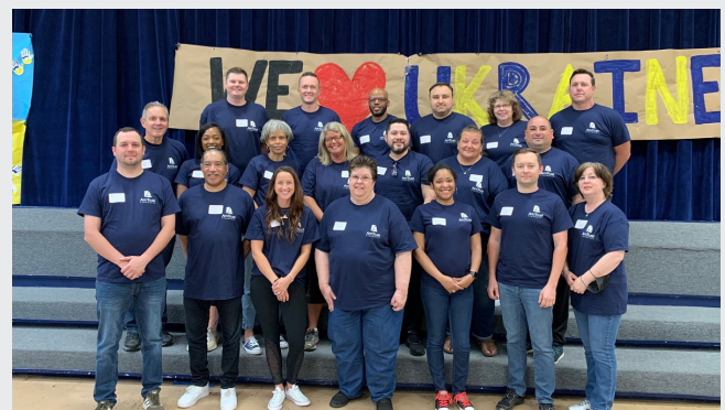
AmTrust team members ran a successful fundraiser for Ukraine in 2022.

AmTrust’s Corporate Governance program is supported by our Enterprise Risk Management, Information Risk Management and Internal Audit departments. We maintain well-defined policies and procedures across the organization. We actively address cyber risk through global employee security awareness training, penetration testing and remediation, advanced application layer firewalls, email protection, vulnerability scanning, and endpoint detection and response mechanisms.